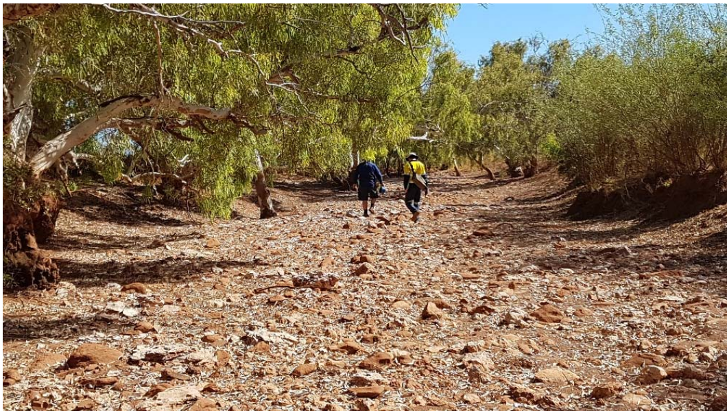
Figure 2. Stream Sediment Sampling at the Quartz Bore Project.

The Company's geologists have also commenced a sampling programme at Quartz Bore investigating the potential for conglomerate-hosted gold mineralisation within the Company's Pilbara projects . The Quartz Bore Project is adjacent to Venturex's Loudens Patch Prospect and proximate to recent "nugget patch" discoveries by De Grey Mining, DGO Gold and Segue Resources (refer ASX.VXR Announcement 18 October 2017, ASX.DEG ASX Announcements 26 September 2017 & 30 October 2017, ASX.DGO Announcement 25 October 2017 and ASX.SEG ASX Announcement 6 November 2017). Initial fieldwork consists of reconnaissance mapping (although outcrop is limited) and surface and stream sediment sampling.